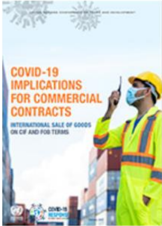
COVID-19 implications for commercial contracts: International sale of goods on CIF and FOB terms