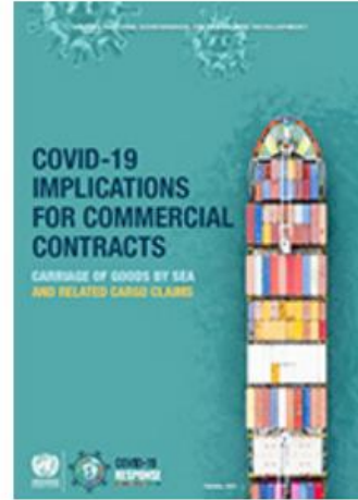
COVID-19 implications for commercial contracts: Carriage of goods by sea and related cargo claims