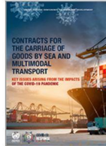
Contracts for the carriage of goods by sea and multimodal transport