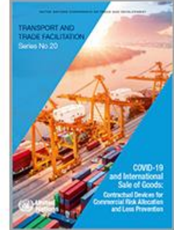
COVID-19 and International Sale of Goods: Contractual devices for commercial risk allocation and loss prevention